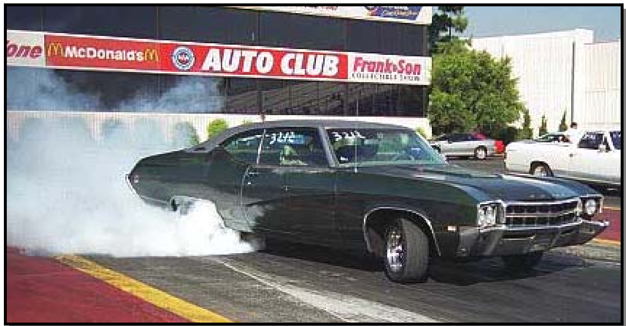
Dan Peper warming up the tires. (See Goodbye Pomona article)