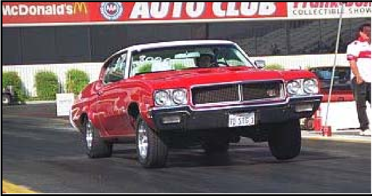
There IS air under Phil Erikson's tire! (See Odds 'N Ends article)